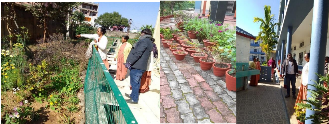
3. Photos: Greenery