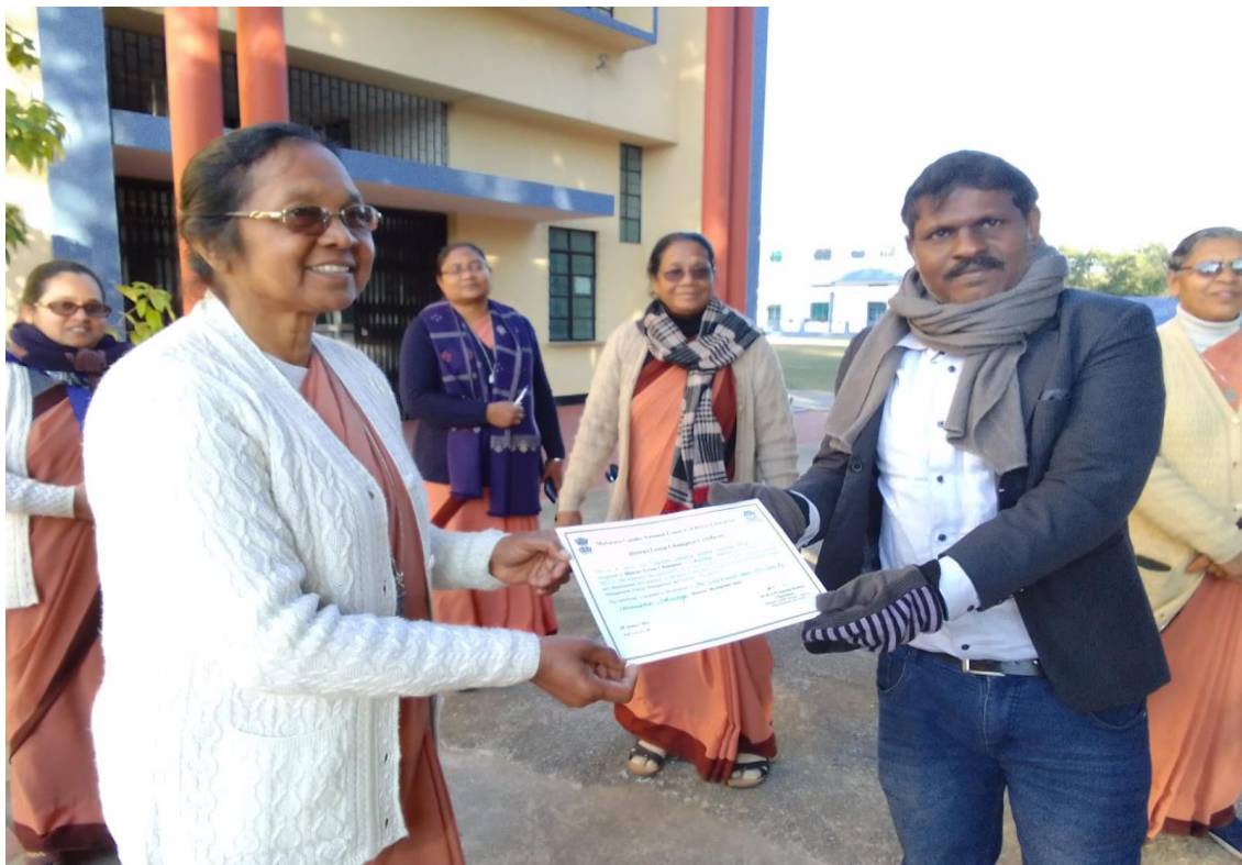
Photos: Awards for the One District One Green Champion Award.