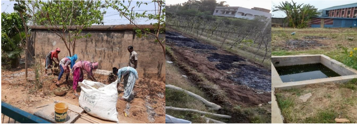
4. Photos: Waste Management